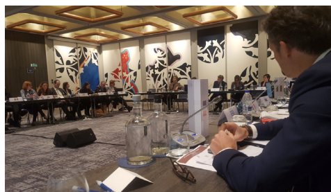
Brussels, 16 March

On 15 and 16 March the national contact points of the European Commission for National Roma Integration Strategies met in Brussels. The first day was dedicated to a discussion about the assessment of the European framework and post-2020 prospects, which was attended by representatives of civil society. The national points of contact met the following day to discuss, in particular, the monitoring tools