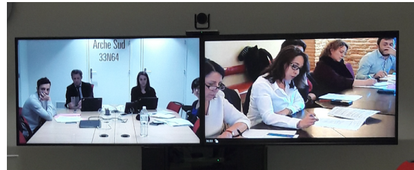
Video conference with Haute-Garonne on 6 April 2018

Since 2013, an annual national appropriations budget has been specifically dedicated to support territorial operations to clear slums and to help support their inhabitants to become integrated. The government has decided to renew this budget of 3 million Euros for the year 2018 to support the implementation of the new instruction of 25 January 2018. A note from DIHAL was sent out at the beginning of March to all of the prefects inviting them to put forward their requests for funding before 13 April. Regarding territories that received funding in 2017, the monitoring of supported actions is carried out in the context of video conference exchanges. Requests for funding will be reviewed from mid-April and the territories will be notified about the funding that they will be granted at the beginning of May.